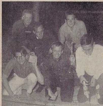
Phi Eta Brothers built a new dining room table.

In addition to disagreeing with the Student Council, Phi Eta has also started one of its most successful rush