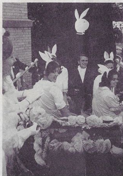
TEP's "Bunnies" . . .