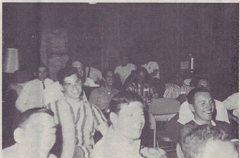
Epsilon Eta's chuckle at "good and welfare."