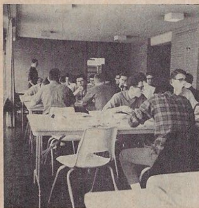
Rho Delts at mealtime . . .

Rushing was the main concern of the Chapter at the beginning. The Chapter rushed 20 boys, giving them a big schedule of events. Our opening activity was a weiner roast at the