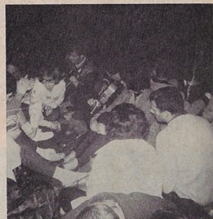
Tau Iota Social . . .

TEP acquired its long-awaited Chapter room, thanks to the Alumni. And the Chapter also made news