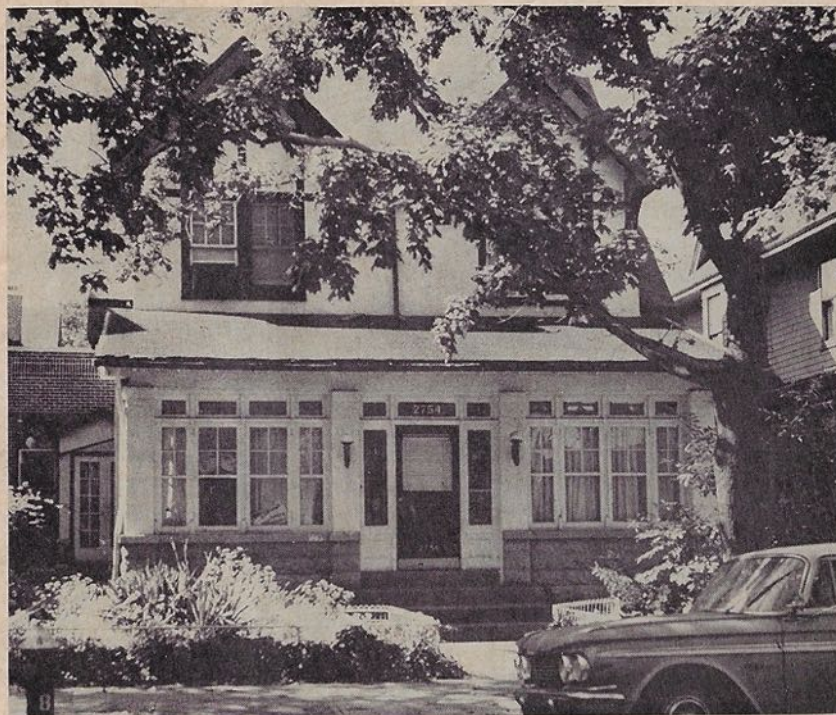
Epsilon Rho's new house is on Bedford Avenue, Brooklyn.

With Homecoming Weekend in October, the Brothers worked day and night to put out our first float. The theme being "Unity for Victory" has inspired us to build the float with an eternal light in which steam flows from dry ice.