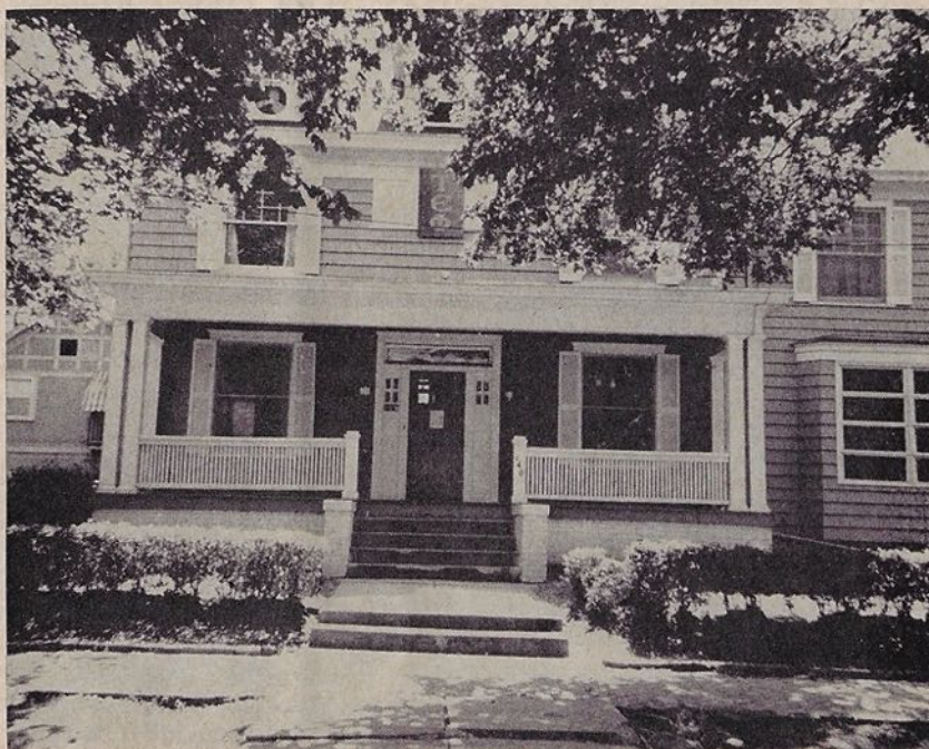
Epsilon Tau house in Peoria.

Homecoming weekend was a big success, even though we lost the football game to Omaha 29-28. TEPs joined up with two other fraternities and a sorority to present a stunt show based on "Music Man." We also put in an all-out-effort to complete our Homecoming float of L'il Abner. To