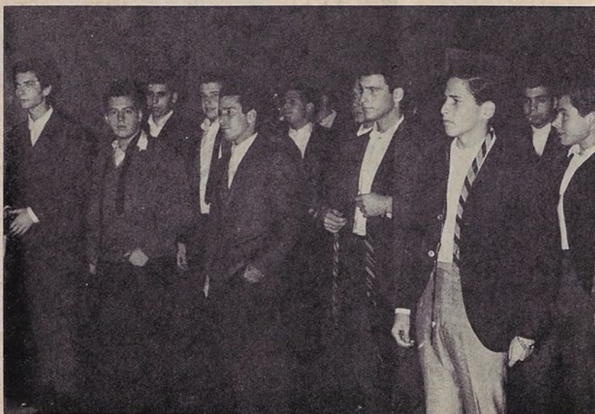
Pledge class initiated by Phi Lambda.